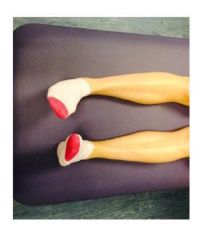
3. Make gentle circles with your foot in one direction and then the other direction. Repeat this 10 times.