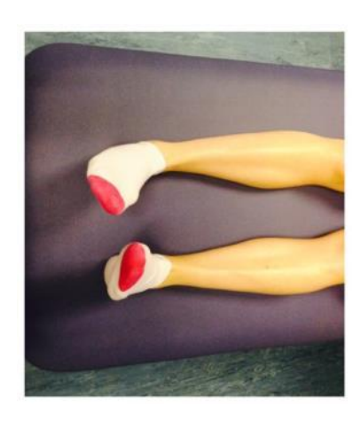
3. Make gentle circles with your foot in one direction and then the other direction. Repeat this 10 times.