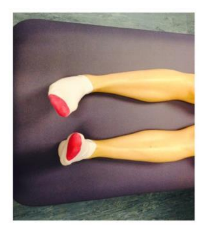
3. Make gentle circles with your foot in one direction and then the other direction. Repeat this 10 times.