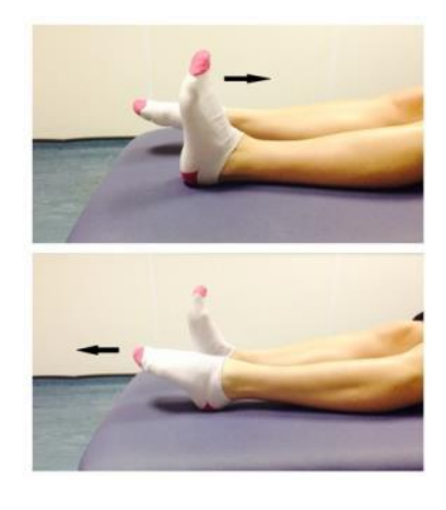
Point your foot up and down. Repeat this 10 times.

Do these exercises 3-4 times a day. Start straight away, you do not need to push into pain.