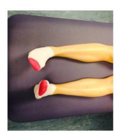
3. Make gentle circles with your foot in one direction and then the other direction. Repeat this 10 times.