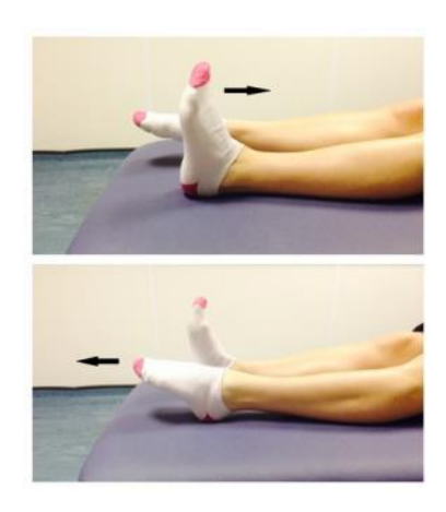
Point your foot up and down. Repeat this 10 times.

Do these exercises 3-4 times a day. Start straight away, you do not need to push into pain.