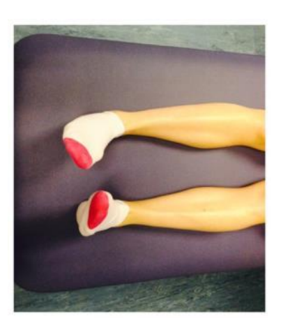
3. Make gentle circles with your foot in one direction and then the other direction. Repeat this 10 times.