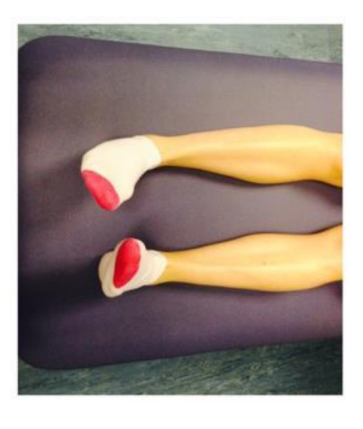
3. Make gentle circles with your foot in one direction and then the other direction. Repeat this 10 times.