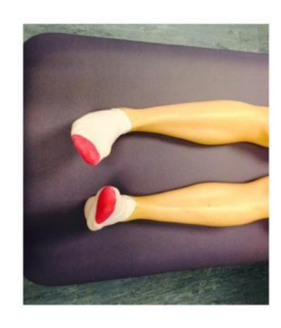
3. Make gentle circles with your foot in one direction and then the other direction. Repeat this 10 times.