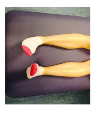
3. Make gentle circles with your foot in one direction and then the other direction. Repeat this 10 times.